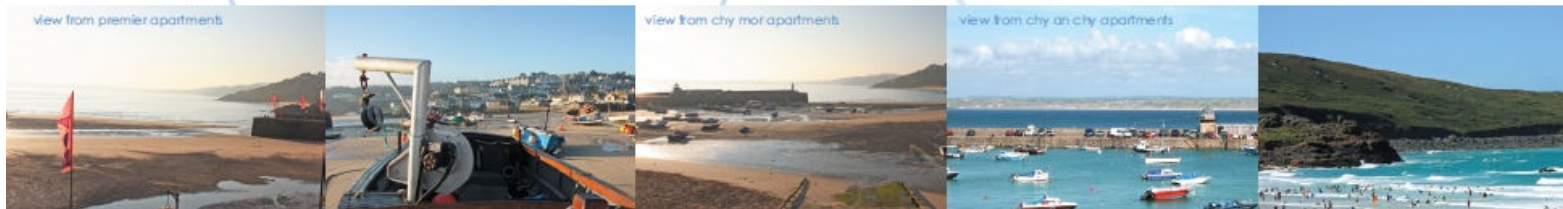
view from chy an chy apartments