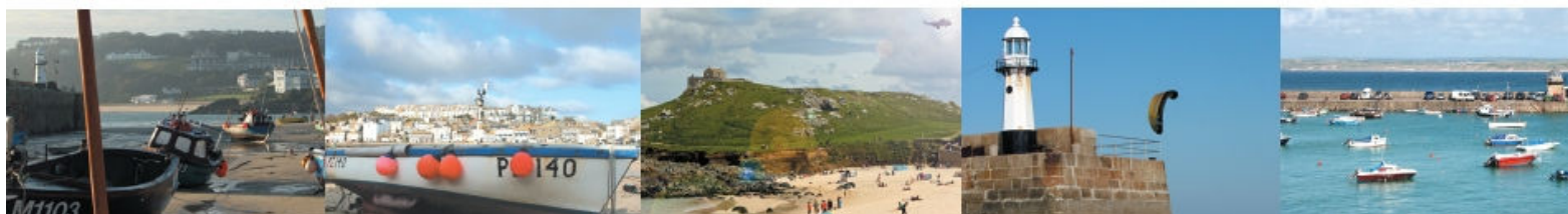
3 Chy an Chy apartments